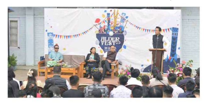
21st - 22nd April 2023