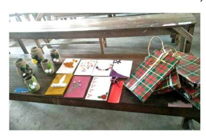
15th February 2019