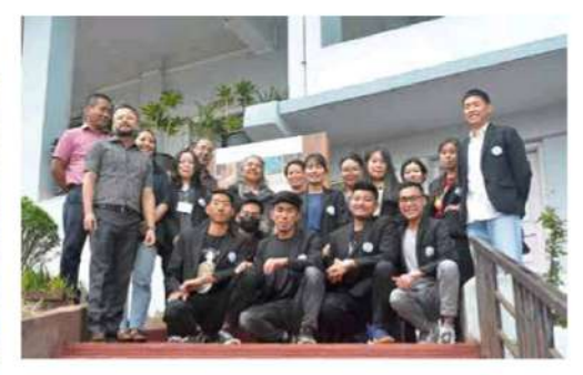
Parting Social cum Picnic for the Political Department at Dzudza Resort, Viphoma 5th May 2023