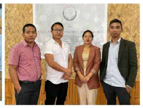
3rd August 2022