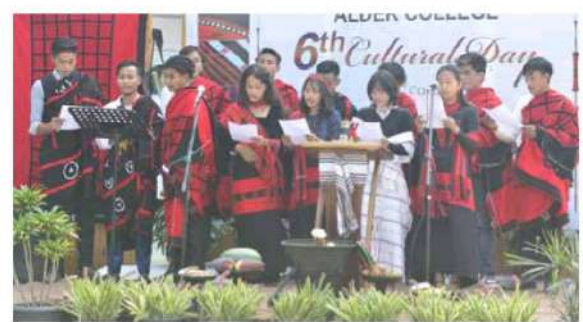
6th Cultural Day: Wearing our Culture and celebrating our indigenous culinary traditions 18th February 2023