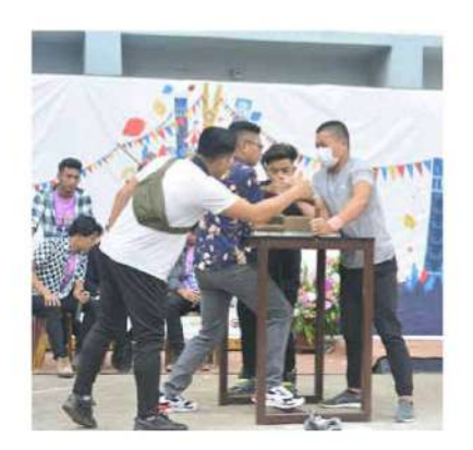
SamaBhav International Travelling Film Festival on Gender Diversity and Inclusion