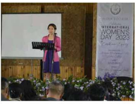
7th March 2023