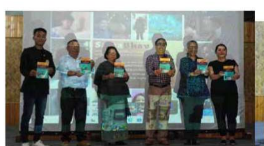
27th - 28th April 2023