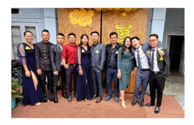
An educational and recreational tour to the green village of Khonoma in Kohima District