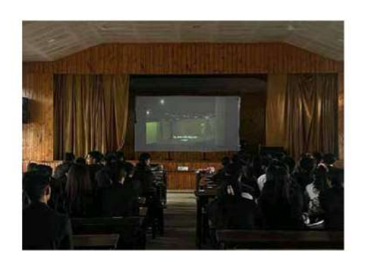
Employment Linked Career Guidance Programme in Aviation, Hospitality, Cruiselines and Overseas Recruitment