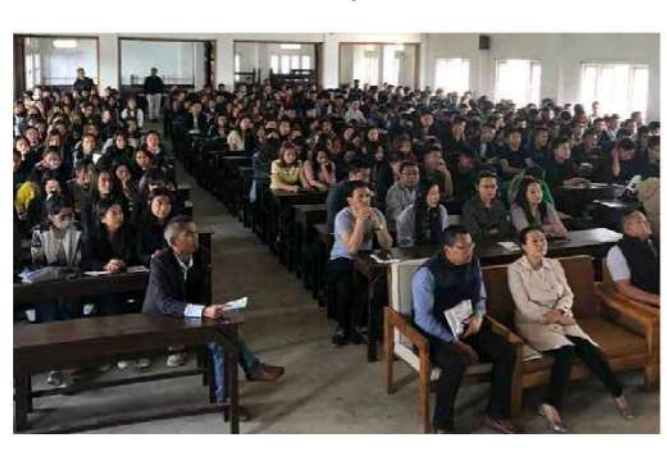
13th March 2020