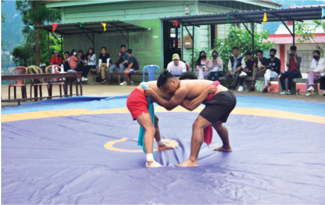
A bout in progress during the college sports week 2022