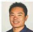
Jia Jiang Best-Selling Author; Blogger; Entrepreneur