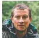
Bear Grylls Adventurer; Writer; TV Host